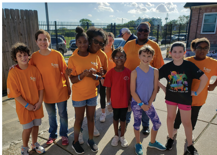
Thanks to Sysco for not only bringing their team to volunteer at our Guadalupe Center Food Fair, but for bringing along their families to serve too!