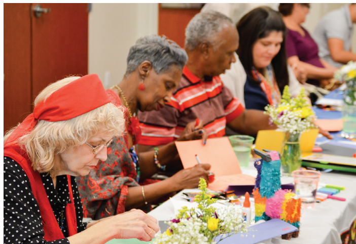
Catholic Charities' Senior Program supports older adults so they can live independently and with dignity. Many seniors are lonely, so we also create opportunities for fellowship.

Our Senior Program provides support and resources to help seniors