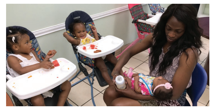
You help provide a safe place for women veterans and their children to stay while they work toward rebuilding their lives.

With your help, Catholic Charities' Women Veterans Program empowers women who served our country and need help overcoming life's challenges. Ours is one of the only programs in Texas that offers services especially for female veterans.