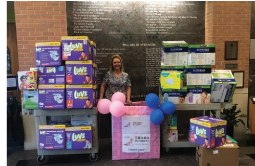
The team at UBS Financial hosted a diaper drive and collected more than 7,600 diapers for parents in need!