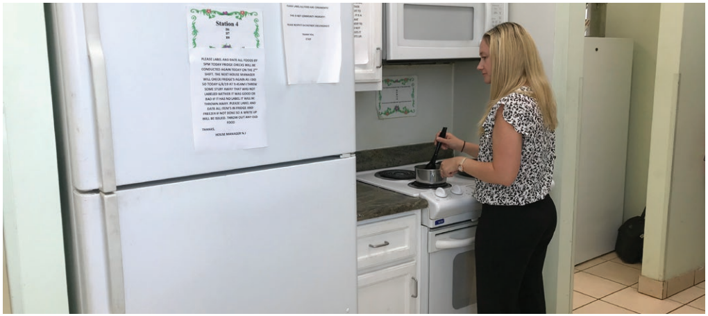
Because of you, women veterans and their children have a safe place to stay at Catholic Charities' Villa Guadalupe shelter. These kitchenettes allow them to cook nutritious food for themselves and their children.

With your help, Catholic Charities can make sure women veterans staying at our shelter are able to prepare healthy, nutritious meals for themselves and their children.