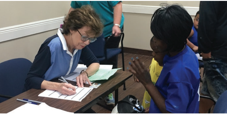
Parts of Galveston County have been devastated by disasters like Harvey, but with your help, Catholic Charities is able to offer case management services to help families rebuild and recover.