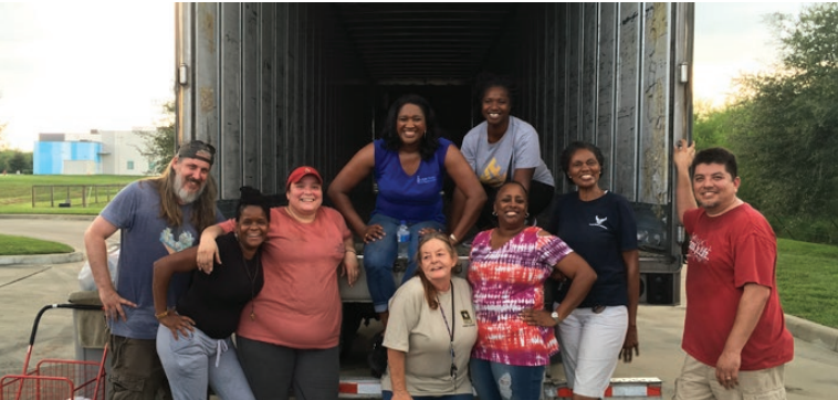
Several of Catholic Charities' women veteran clients helped unload donation trucks during Hurricane Harvey.

Your support also enables Catholic Charities to continue offering our transitional housing services for any woman veteran in Galveston that is homeless.