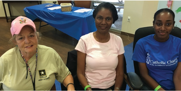
Thanks to you, Catholic Charities offers peer-to-peer groups where women veterans can feel safe to share their experiences with their peers, which helps them on the path to healing and self-sufficiency.