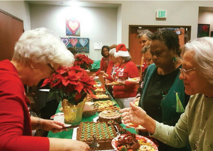
More than 150 seniors at the Mamie George Community Center enjoyed a special Christmas party complete with gifts and goodies to celebrate the season. A special thanks to the St. Laurence Catholic Daughters group for hosting the event and providing food and gift bags, and to St. Faustina for providing more than 200 gifts for our seniors!