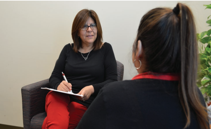
Catholic Charities' counselors already received training on trauma care prior to Harvey, but because of your support they were able to attend advanced training to help meet the community's mental health needs.

Because of you, in the months since Harvey, the Catholic Charities' Counseling Services team has received advanced training and made additional presentations to help those facing mental health challenges as they work to rebuild their lives and find their new normal.