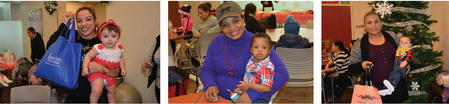
Our Blessed Beginnings program hosted a potluck lunch for our prenatal and parenting classes in December for more than 50 women and their babies. Because of your support, we were able to raffle off baby items and all in attendance were able to receive diapers, wipes, blankets and formula if needed.

For the past 24 years, you have opened your hearts to spread the joy of Christmas to those in need through our annual Share Your Blessings program. This year was especially tough after Hurricane Harvey devastated our community, but once again your generosity provided more than 6,400 individuals and their families with gifts who would otherwise not be able to afford them. We are so grateful to our supporters and parishes who donated gifts or dedicated their time and volunteered to make sure so many families had gifts for Christmas. Thank you!