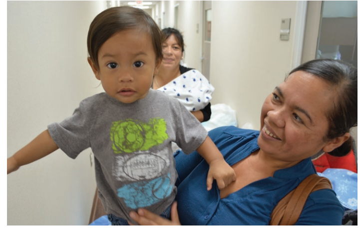
Your continued generosity enables Catholic Charities to help families who are still struggling recover from Harvey.

With Your Help, Catholic Charities Was There to Respond After Hurricane Harvey