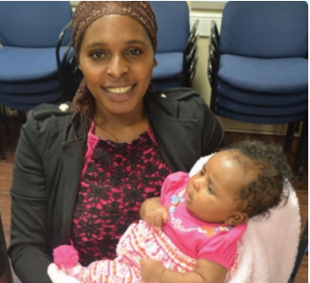
Many of our mothers brought their little ones to enjoy the festivities.

A special thank you to The Church of Jesus Christ of Latter-day Saints, St. Laurence Catholic Church, and other private donors for their generous donations. Your support helps families in need be able to provide and care for their children.