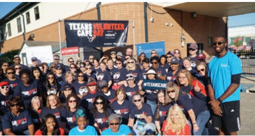
More than 100 volunteers donated over 1,000 service hours on May 6 during Texans Care Day at the Villa de Guadalupe feeding families and cleaning up the facilities.

Visit our website for the full recap and more photos: www.CatholicCharities.org/wineanddine .