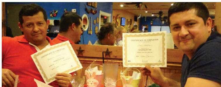
Fathers show their certificate after completing the 24:7 Dad program, which is free for all fathers in Fort Bend County.