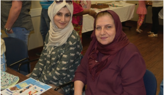
Several clients were able to mingle with other expectant parents.