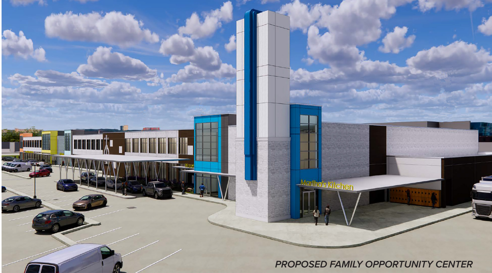
PROPOSED FAMILY OPPORTUNITY CENTER